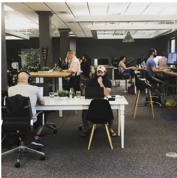
Rise and grind! Just a typical morning at VCET.