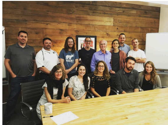
Congressman Peter Welch pays a visit in October!