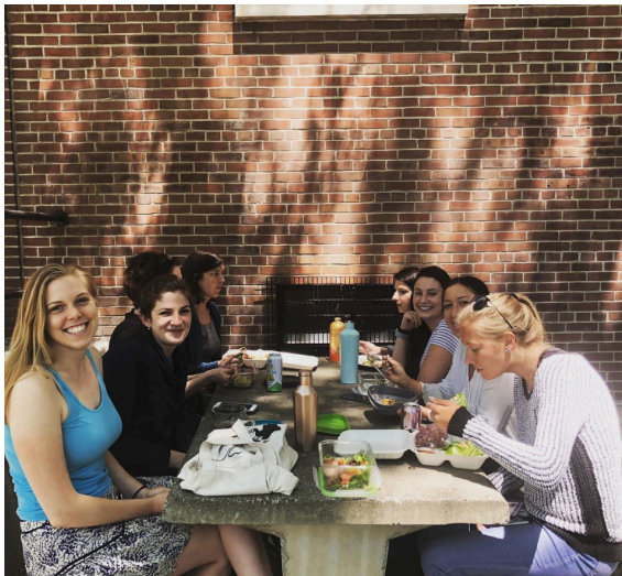
Women of VCET enjoy a beautiful summer afternoon.