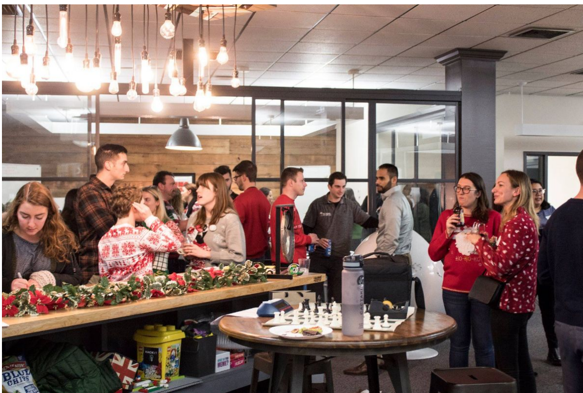
Burlington Young Professionals and VCET team up for a very festive Ugly Sweater Party!