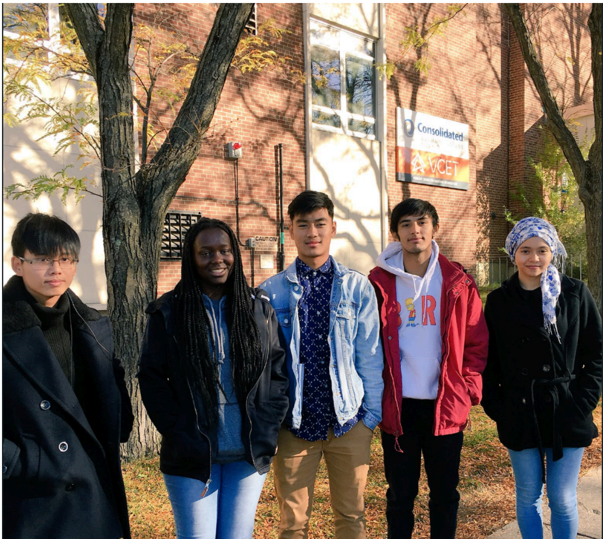
Winooski High School business students visit VCET@BTV in October.