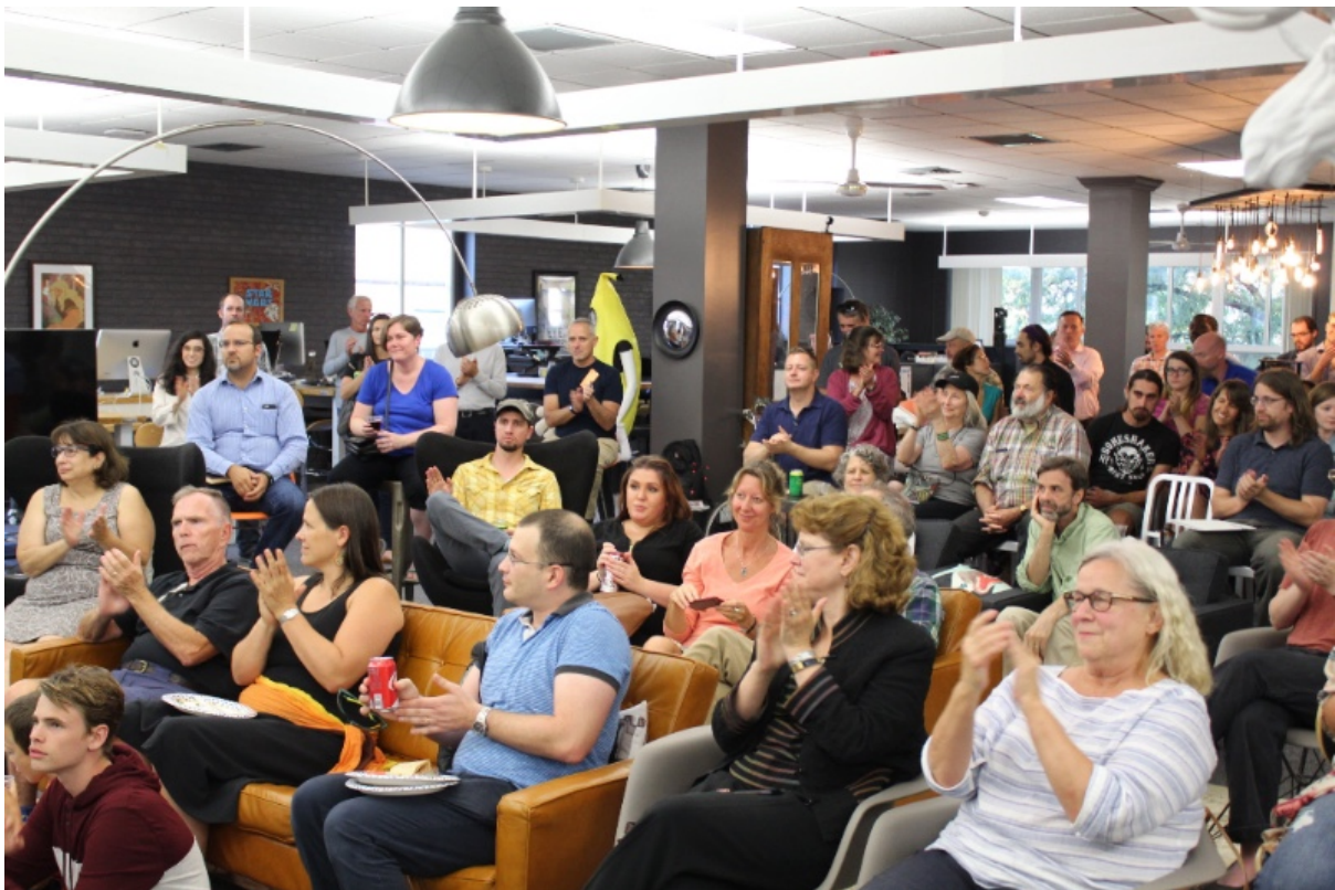
Burlington Code Academy's Cohort 0 Demo Night was a packed house!