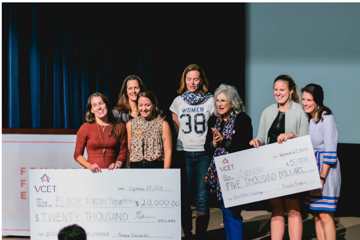
The judges and winners of the Female Founders Start Here Challenge pitch event. Congrats to Elmore Mountain Therapeutics and Overeasy!